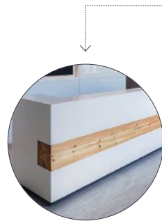
A heavy timber column was salvaged and incorporated into the concierge desk fabricated by local artists at Icon Modern.