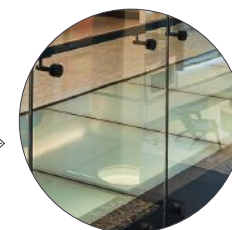
The loft “bridge” is meant to further connect the two levels. The clear glass guardrail is a visually minimal barrier, while the frosted glass walking surface conveys hints of people moving above the concierge desk.

Wood structural members were salvaged from the old building and used as treads of the stairs connecting the lobby and loft library.